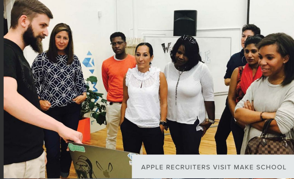
APPLE RECRUITERS VISIT MAKE SCHOOL