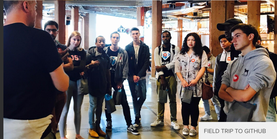
FIELD TRIP TO GITHUB