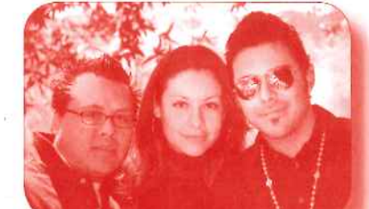
LHM 2006 Co-chairs