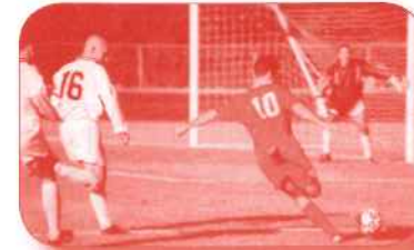
Fútbol (Soccer) Mini World Cup