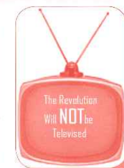
The Revolution will NOT be Televised