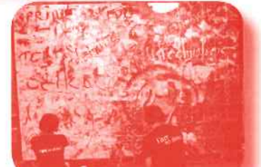
Closing Ceremony: Meet the Artist