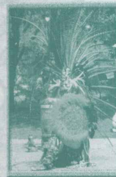
Calpulli Huitzalopochtli Performers