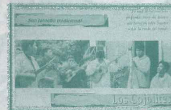
Los Cojolites Performers