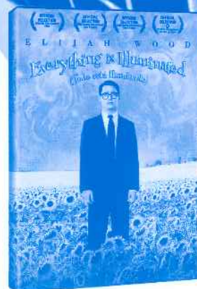
I EVERYTHING IS ILLUMINATED