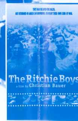
II THE RITCHIE BOYS