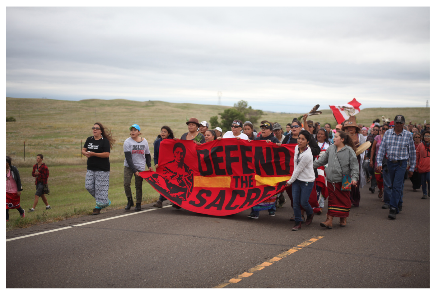
Marchers at Standing Rock 2016; Photo by Nicholas Ward