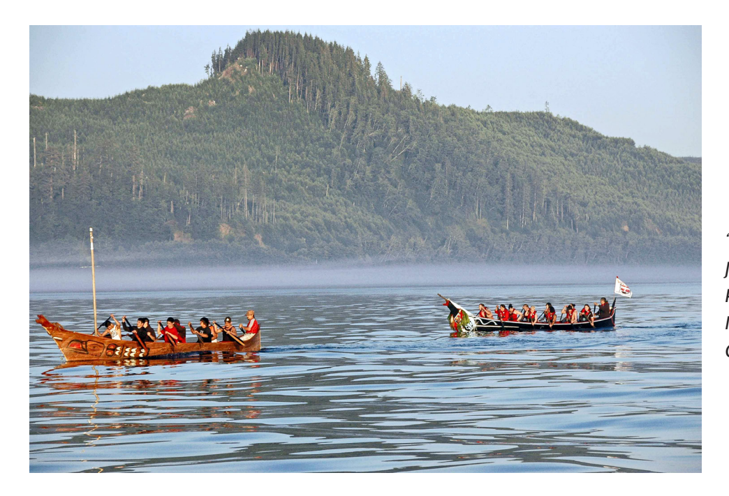
"Annual Canoe Journey, Washington"

Any space, three-dimensional or digital, presents an opportunity to surface buried truths and lift up Native sovereignty, priming our collective culture for deeper truth and reconciliation efforts.