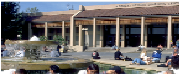
De Anza College www.deanza.edu

Foothill and De Anza Colleges are considered to be among the best community colleges in the U.S., especially known for their excellent academic programs, outstanding student services, high transfer rates to excellent 4-year universities, and a great location-about 45 minutes south of San Francisco.