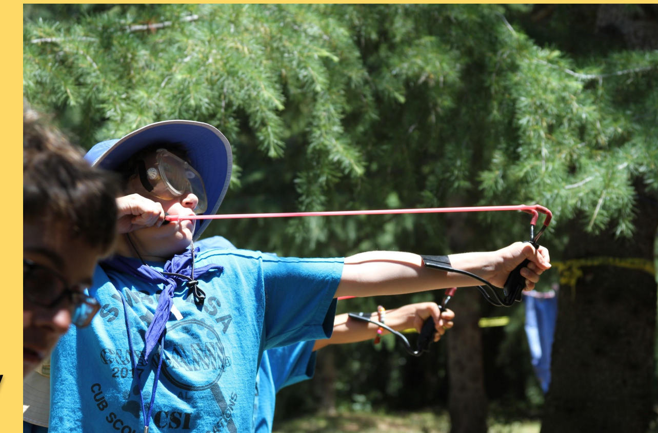
In addition to Nerf guns, we use slingshots as an official range instrument that has its own safety guidelines and rules.