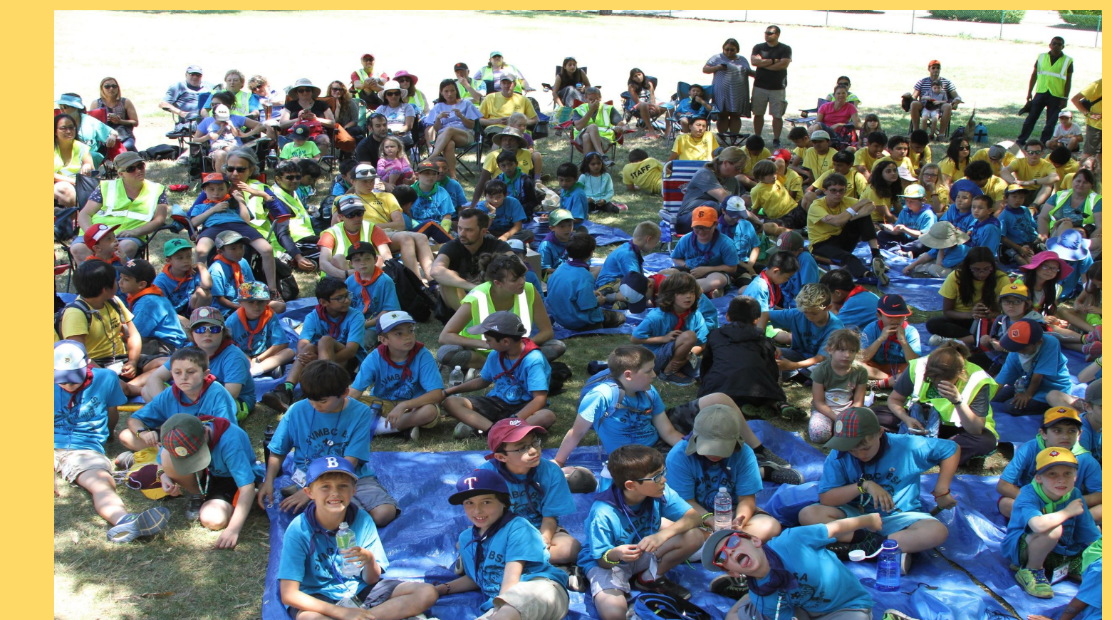
100+ kids and youth staff gather for the closing ceremony.