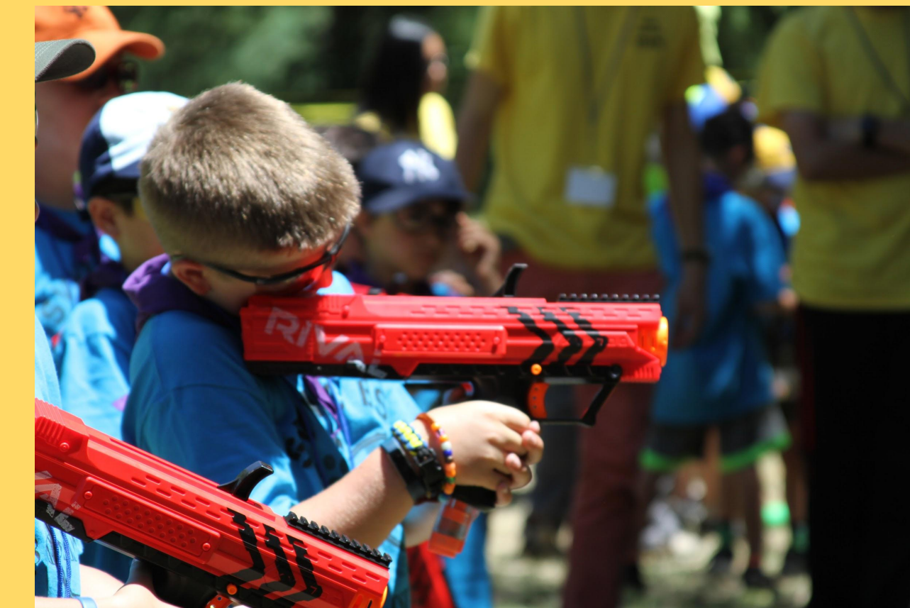
At Vasona location, we are unable to use BB guns, so we practice gun safety with Nerf guns in a makeshift range.