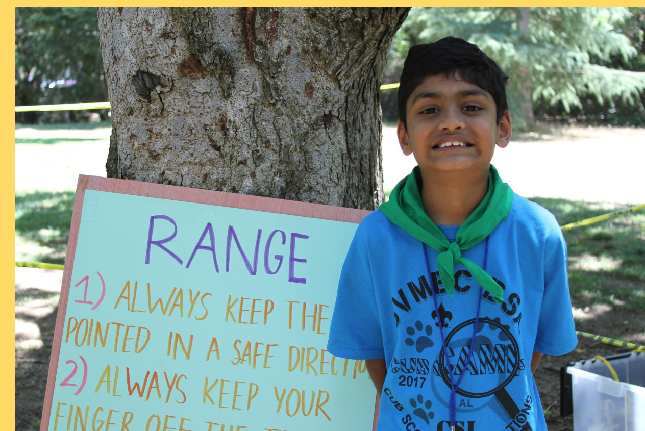
While on the range, we incorporate rules and encourage learning to have fun while following instructions.