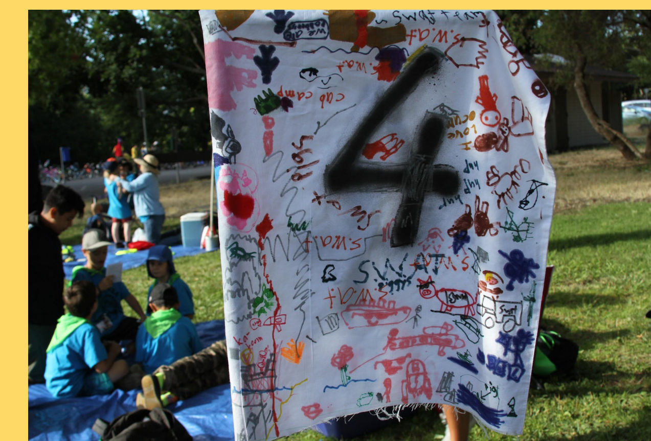
An example of a personalized den flag that each den gets to create.