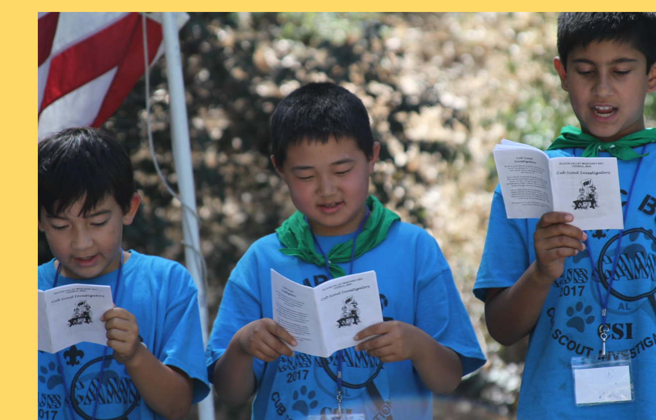
Scouts perform a song at the last flag ceremony of the week.