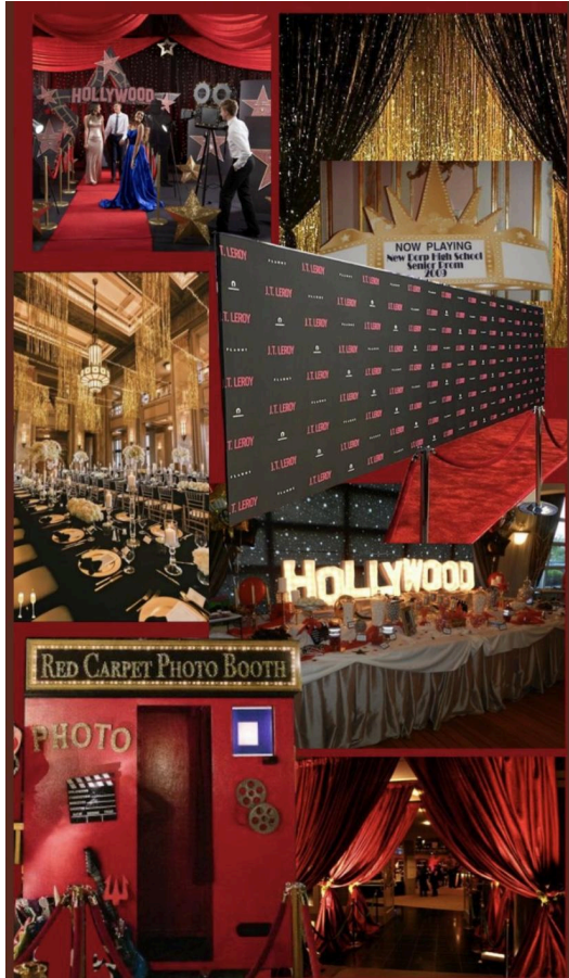
photo booth will be provided.

B. TedX Club will be meeting today, Tuesday, January 23rd, 2024 at 3:00 PM.